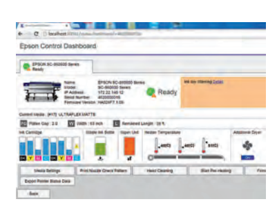
The Epson Control Dashboard simplifies operation by letting you run cleanings, check ink levels, update firmware and more from a single screen.