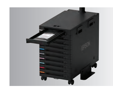
Easy-to-use 1.5 liter bulk-ink packs save time and money,<sup>5</sup> reduce waste<sup>5</sup> and increase uptime because you have to replace ink less frequently.