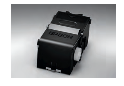
A first-of-its-kind fabric wiping system improves printhead life while automating maintenance to keep your printer running in top form.